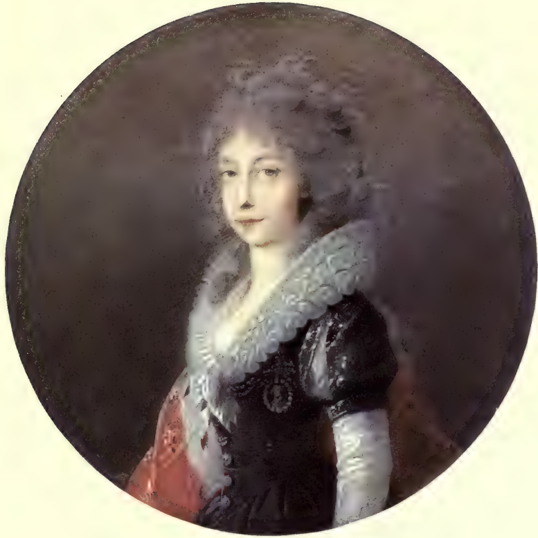
EMPRESS MARIA THERESIA, SECOND WIFE OF THE EMPEROR FRANCIS I OF AUSTRIA BY HEINRICH FRIEDRICH FÜGER